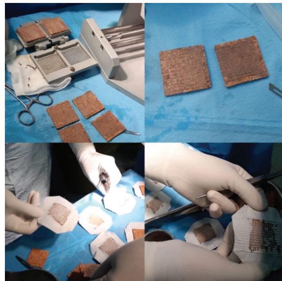
Fig. 2: Preparation of skin graft with modified Meek technique.