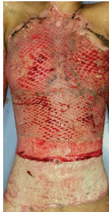
Fig. 1: Upper chest covered with meshed skin graft.

The average duration of operation in modified