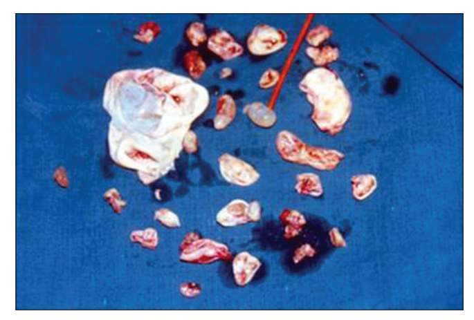
Figure 2: Multiple daughter cysts taken out from primary as well as the site of dissemination

Hydatid involvement of the liver and lungs has been most commonly described (90%).<sup>2,3</sup> Bone affection is