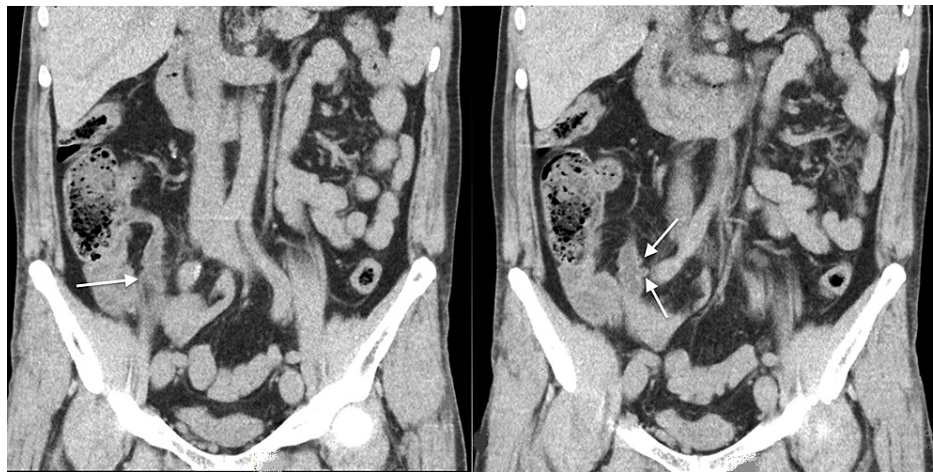
FIGURE 2: Coronal images of the abdominal computed tomography scan showing multiple diverticula of the appendix (white arrows).

All patients who presented with acute abdominal pain were evaluated. Computed tomography was utilized to examine nine patients, whereas ultrasonography was used in only one patient (Figure 2). Nine patients were operated on with the diagnosis of acute appendicitis and one patient with intra-abdominal perforation. Leukocytosis in seven patients and neutrophilia in five patients were observed.