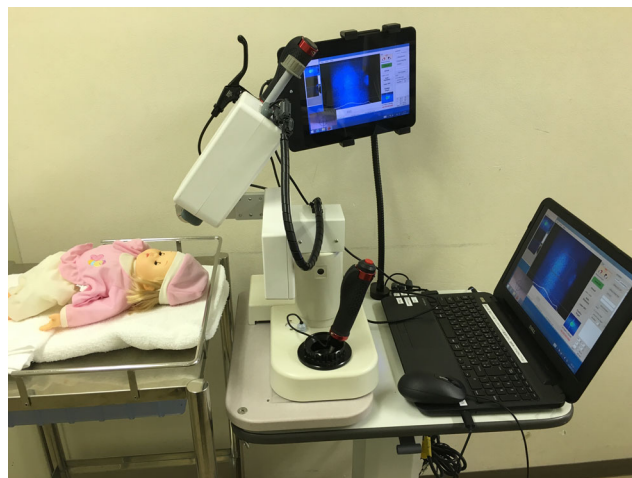
Fig. 1 The LSFSG-baby system. Examination of a neonate in the supine position. The system's camera is set on a tilting stage with two axes ( \phi and \theta ) and x - y stages to adjust the field of view

Measurements were obtained using the 'LSFSG-baby' system [21], which is a version of the commercially available LSFSG-NAVI system (Softcare, Fukuoka, Japan) modified in such a manner that the testing can be performed with the neonate in the supine position (Fig. 1). The testing followed previously reported methods [21]. Briefly, pupillary dilation was achieved with 2.625 % phenylephrine hydrochloride, 0.125 % tropicamide and 0.25 % cyclopentolate, after which the ONH was imaged for 3 sec. Testing was performed while the infant was sleeping to measure his or her circulation during rest. Without the use of a lid speculum, the tester gently held the infant's eyelid open with a finger during the examination. All measurements were performed by the same tester. The testing was concluded within 10 min, and measured only the left eye. After testing, the images were confirmed, and results