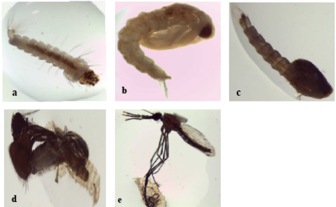
Fig 2. Phenotypic aberrations exerted by proanthocyanidin-rich fractions on An. gambiae (s.s.) larval development. Exposure to green tea proanthocyanidin-rich fractions at sublethal doses disrupted larval development inducing abnormal larval-pupal intermediates and prevented adult emergence with mouthparts, wings and legs stuck within the pupal caste. a: Normal larvae, b: Normal larval-pupal intermediate, c: Abnormal larval-pupal intermediate, d: Disrupted adult emergence with mouthparts, wings and legs stuck within pupal exuvium, e: Failure in adult emergence showing legs stuck in pupal caste. Analysis was performed under a light microscope at magnification of 25 \times .

https://doi.org/10.1371/journal.pone.0173564.g002