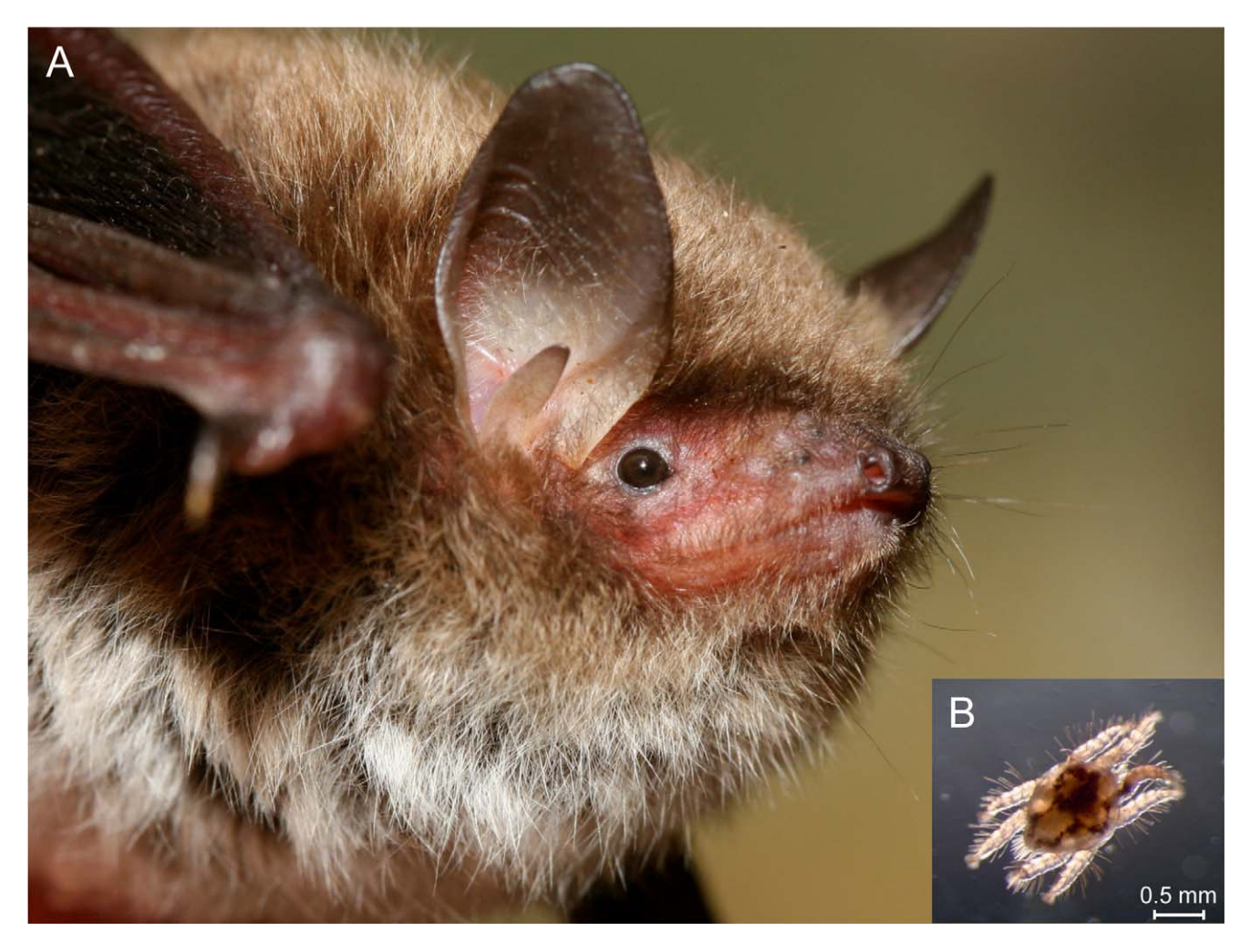
Figure 3. Photos of the ectoparasitic mite Spinturnix andegavinus (B) and of its host bat Myotis daubentoni (A) to which the parasite is sex specifically adapted. doi:10.1371/journal.pbio.1001271.g003

Parasite adaptation to host sex can have important implications for host–parasite coevolution. We have proposed that the sex of the host can drive parasite sexspecific adaptation when parasite subpopulations evolve mainly in one host sex. For the host, however, selection on one sex only can be impaired by intra-locus sexual conflict [54,55] when alleles that confer parasite resistance or tolerance in the affected sex decrease fitness of the other sex. The expression of traits associated with parasite resistance may thus become sex limited.