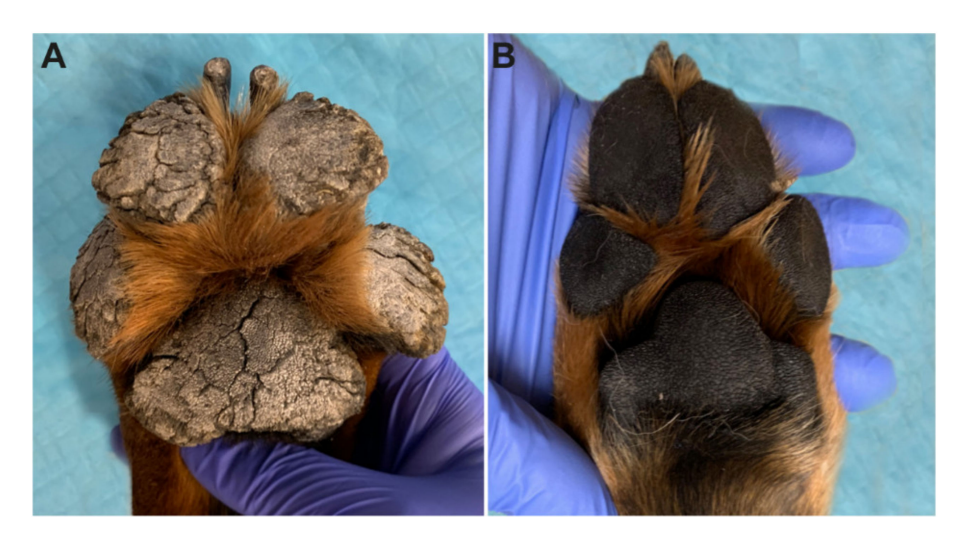
Figure 1. Clinical phenotype at six months of age. (A) Marked expansion of the footpads by thick projections of dense keratin in the affected Rottweiler. The adjacent haired skin appears unaffected on this image. (B) Footpads of a normal six-month-old control Rottweiler.

A six-month-old male intact Rottweiler dog presented for evaluation of thick, rapidly growing footpads and discomfort (shifting stance, unwilling to stand for long periods). An unusual appearance of the pads (described as "dryness") had been first noted by the owners when the dog was obtained at eight weeks of age. At the time of the initial presentation, the patient was otherwise healthy with no other systemic or dermatologic signs. On examination, all pads on all feet were markedly thickened by dense mounds of adherent keratin (Figure 1). The digital pads and metatarsal/metacarpal pads were the most severely affected. Fissures and mobile keratin ridges were present along the edges of the pads. There was mild diffuse scale over the trunk, which was considered to be within normal limits.