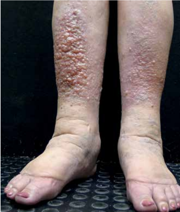
FIGURE 1: Translucent erythematous papules forming plaques in the pretibial region

associated with autoimmune thyroid disease. 1