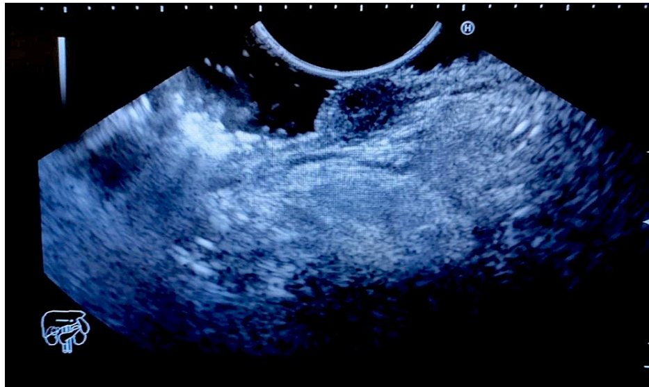
FIGURE 2: EUS showing a 2.2 cm hyperechoic lesion arising from the second layer (submucosa) with no calcification, cystic change, or ductal structure