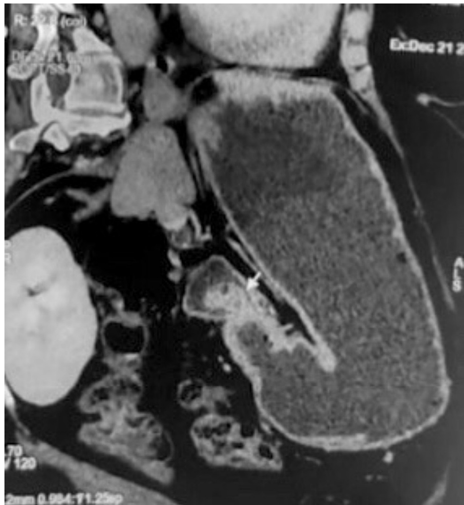
FIGURE 3: Contrast-enhanced computed tomography showing a homogeneously enhancing polypoidal mass arising from the posterior wall of duodenal bulb measuring 2.3 x 1.5 x 1.5 cm with no periduodenal fat stranding