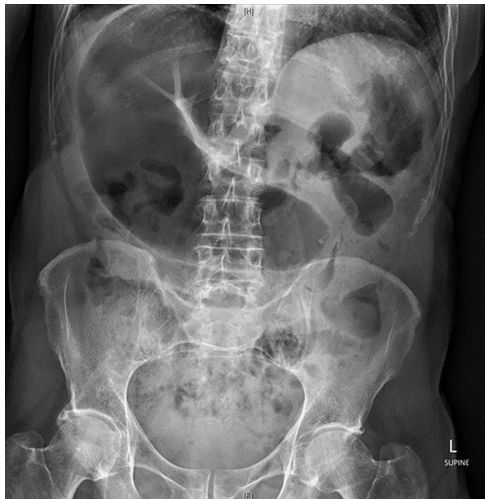
Figure 1: Abdominal X-ray on presentation showing a distended loop of colon with air-fluid levels.

and Parkinson's disease who underwent a laparoscopic colectomy for a recurrent volvulus in the context of a prior laparoscopic anterior resection for cancer.