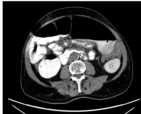
Figure 2: CT scan demonstrating a dilated colonic loop with air-fluid levels and swirling of the mesentery, indicative of a large bowel obstruction secondary to a volvulus.

Large bowel volvulus is an uncommon cause of obstruction and occurs when a redundant loop of colon twists upon its mesenteric attachment. In most cases, the long redundant colon is a result of chronic constipation, where prolonged colonic distension due to fecal loading can result in elongation [5]. Laparoscopic surgery mitigates the formation of intraperitoneal adhesions and this can predispose to redundancy and volvulus of previously mobilized colon [6]. A systematic review by Toh et al. [1] showed that volvulus following colorectal surgery is rare and nearly all cases took place within 4 months of surgery. Our