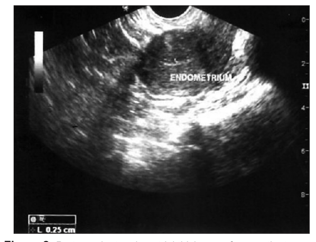
Figure 2: Pretransplant endometrial thickness of one patient

In this pilot study, six women with severe AS with secondary amenorrhea and infertility who had failed to respond to the standard treatment of hysteroscopic adhesiolysis followed