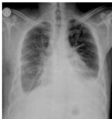
Fig. 2. Showing bilateral pleural effusion and pericardial effusion.

Chylothorax with chyloous ascites associated with pericardial effusion is a rare finding. If the cause is malignancy, it is difficult to treat. There are only few