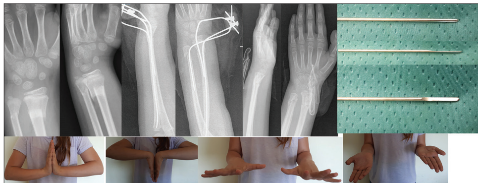
Figure 1: A 6-year-old girl. Radiographic images refer to pre-operative, immediately post-operative and 7 days post-wires removal. The flat tip allow to drive the wire into the medullary canal. The clinical images refer to 3 years post-operative follow-up