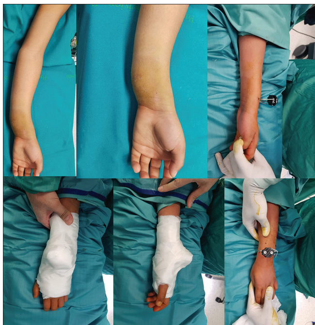
Figure 2: A 11-year-old boy. The wires are locked into an external radiolucent plate, and covered with a soft dressing