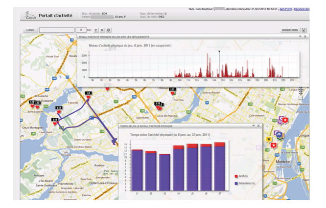
FIGURE 2: Interactive application for spatio-behavioural data visualization: GPS tracks, activity locations, and corresponding physical activity levels. NB: map indicates GPS tracks for one day automatically detected activity locations. Upper graph indicates physical activity levels during the day in relation to location (track). Lower graph shows time spent per physical activity level for each day.

Expert-system generated indicators of physical activity, spatial information or combinations thereof are visualised through an interactive module through tables, graphs, or maps (see example of visual presentation of patient's residential neighbourhood and opportunities in Figure 1 and additional graphs and maps in Figure 2). This visual interface is used by health care professionals to better understand the