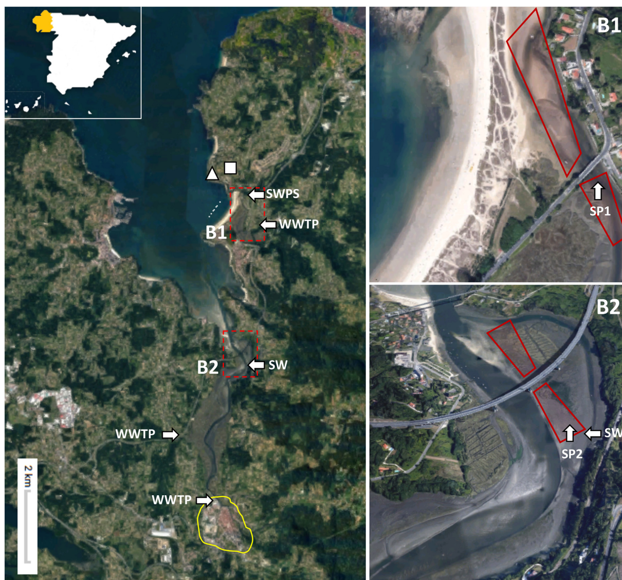
Fig. 1. Map of the estuaries and river catchment in Galicia (NW of Spain) showing the clam banks 1 (B1) and 2 (B2) (red squares), and sampling points (SP1 and SP2). Locations for wastewater treatment plants (WWTP), sewage pump station (SWPS) and non-treated sewage outfalls (SW), a camping area (white triangle) and an urbanization (white square) are indicated. During the summer, there is a significant increase of the population in the area surrounding bank 1 due to tourism. Municipality where the outbreak was reported is marked in yellow.