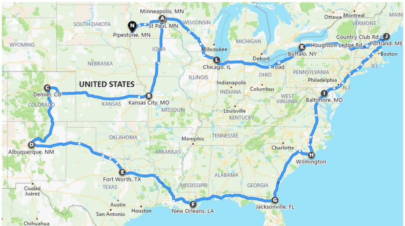
FIGURE 1 Map displaying the route travelled during the study

On day 0 and day 23 post-inoculation, the seven totes were sampled using a method based on the Association of American Feed Control Officials (AAFCO) Feed Inspector's Manual, which had recently been validated for detection of PEDV in feed (Jones, Stewart, Woodworth, Dritz, & Paulk, 2020a). Totes were sampled using a 0.99-cm long stainless-steel grain probe with an open