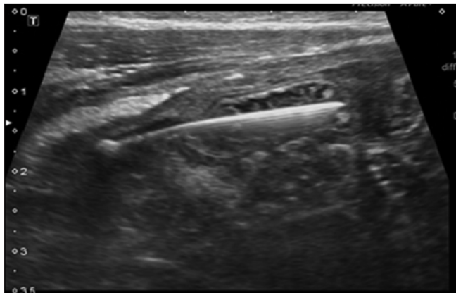
Figure 1: Sonographic imaging of right lower quadrant