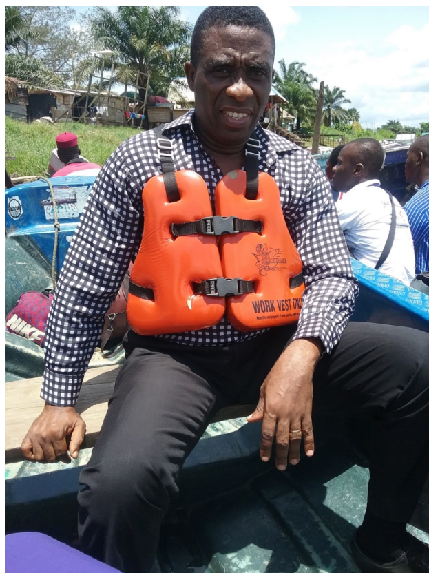
Figure 3 Boat rescue mission team member.

Multiple modes of transport in our environment can be used in mass casualty, after a proper triage has been done allocating the safest mode of transport for each patient. These include ICU ambulances (Figures 1A,B and 2A,B) equipped for resuscitation and smaller vans. “keke” tricycles could be good for ease of transportation but could be dangerous for a spinal cord-injured patient. Boats (Figure 3), private cars, and Hilux jeeps are other alternatives, depending on the terrain. Helicopters and air ambulances are engaged under special arrangements, when REL of accident victims request for transfers to more specialized centers from receiving hospitals. While we work toward improving our services, it