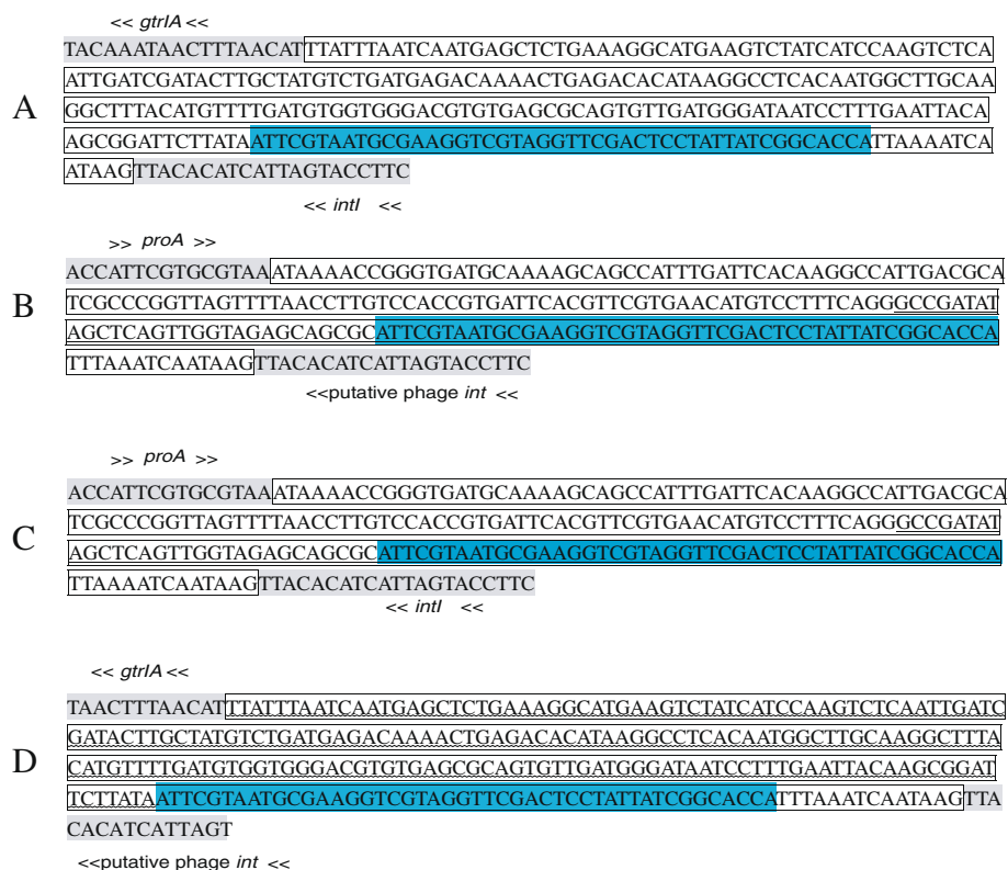
Figure 3 DNA sequences of chromosomal integration site of S. flexneri phage Sfl. Sequences obtained by PCR and sequencing of junction regions using a series of primers across the integration site. (A) attP in phage Sfl. (B) attB in strain 036. (C) attL in strain 036_1a. (D) attR in 036_1a. Sequences in box are DNA regions between conserved genes; Underlined sequences are tRNA-thrW ; Sequences in blue are att core sequence; Conserved genes are shaded and their transcription orientation is marked by an arrow.

tRNAscan was used to find tRNA genes. Two tRNA genes in tandem, with anticodons GUU for asparagine (Asn) and UGU for threonine (Thr), were found to be located downstream of gene Q (35,738 – 35,809 for Asn, and 35,818 – 35,890 for Thr). One or both of these tRNA genes were also to be found located at this position in phage Sf6, ST64T, PS3 and p21 [10,26,27]. A recent study