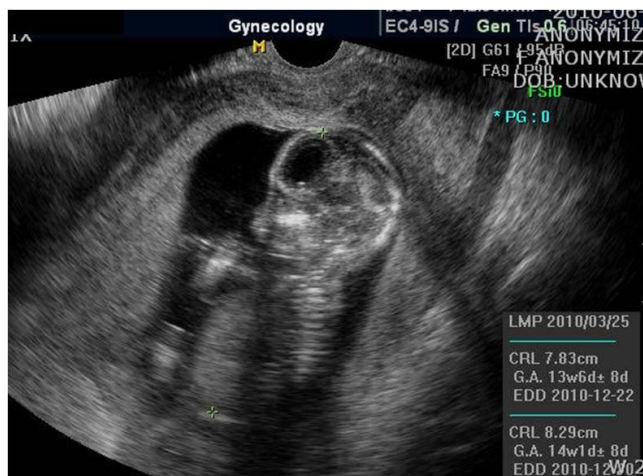
Figure 1 Ultrasound examination showing intrauterine pregnancy at 14 weeks gestation.

At the time of laparoscopy, 800 ml of fresh blood and 0.5-cm fundal defect of the uterus were noted (Fig. 2). The placenta and amniotic membrane were seen bulging spontaneously and slowly, and the uterine defect was gradually enlarging, with its size increased to 3 cm as last noted. Because the amount of blood in the ruptured area increased rapidly, we decided to convert laparoscopy to laparotomy. At the beginning of the laparotomy, the fetus was spontaneously delivered through the ruptured site. We preferred total abdominal hysterectomy to conservative management because of the large, fragile, and thin uterine wall with abundant blood vessels on the surface. The total estimated blood loss during the operation was 1000 ml; the patient was transfused 4 units of packed red blood cells and 2 units of fresh frozen plasma. Her recovery was uneventful, and she was discharged on postoperative day 6. The final pathological examination revealed that the chorionic villi had invaded the entire myometrium up to the serosa, confirming the diagnosis of placenta percreta (Fig. 3). The length of the fetus measured from the crown to rump was 9.0 cm, and fetal weight was 69.3 g; these measurements were consistent with 14 weeks of gestation.