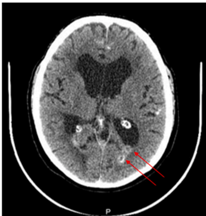
Fig. 1. Cranioencephalic (CE) computerized tomography on day 0. Ventricular enlargement suggestive of active hydrocephalus is apparent as well as two nodular contrast enhancing lesions in the left lateral ventricle (pointed by red arrows). (For interpretation of the references to colour in this figure legend, the reader is referred to the Web version of this article.)

On day +16, cranioencephalic (Fig. 2) and neuroaxis magnetic