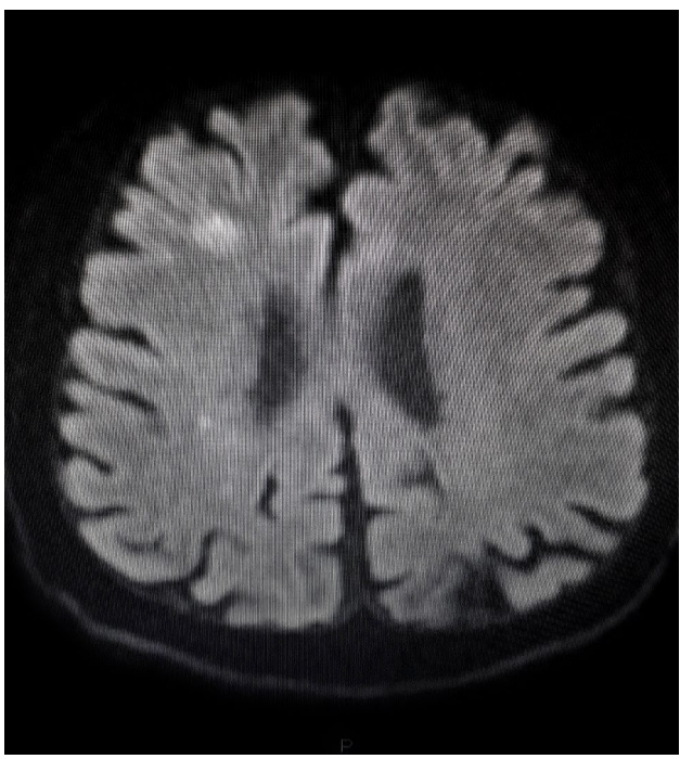
Figure 1. Subacute ischemia areas in the right centrum semiovale in the magnetic resonance imaging fluid-attenuated inversion recovery sequence.

Case 3- A 52-year-old male patient presented with painless weakness in their left hand, which had started 20 days ago. The patient revealed that they were evaluated by EMG and cervical MRI, which were inconclusive. In the neurological examination, the patient's left-hand distal muscles were plegic. Proximal muscles of the left upper extremity, right upper extremity, and bilateral lower extremity muscles were normal. There was no pathological reflex, and DTRs were normal. The patient's blood pressure