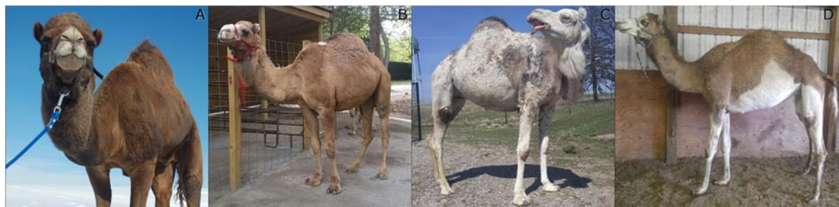
Figure 1. Range of white spotting phenotypes in this study. (A) A minimally spotted camel (US30), displaying white patches on both upper lips. (B) A minimally spotted camel (US25), showing a facial marking and white spot in front of the hump. (C) An extensively spotted “mottled white” camel (US28), with pigmented regions concentrated along the topline. (D) A moderately spotted “clear white” camel (US34), showing clear definition between pigmented and white regions.

The degree of white spotting of each animal varied greatly, ranging from white only on the lips, to white on approximately 80% of the body (Table 1, Figure 1). Camels with extensive markings had blue eyes. Samples US27 and US41 were recorded as solid white as there were no obvious colored patches of fur. “Mottled white” indicates that the border between the colored and white fur was jagged and uneven, and/or with regions where colored and white fur were intermingled (Figure 1C). “Clear white” indicates a well-defined border between colored and white fur, though with possible flecks of color within predominantly white patches (Figure 1D). Minimally spotted camels often had white restricted to the “points”—the face, legs, and tail. The US spotted camels were visibly smaller in overall body size than the solid camels, though no quantitative measures were assessed. Two of the owners mentioned that spotted camels are known for being roughly 30 cm shorter at maturity.