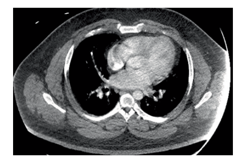
FIGURE 2: CT angiogram chest with intravenous contrast shows small to moderate left lower lobe pulmonary emboli. A 2 cm pleural-based right lower lobe nodular density can also be seen. It should be noted that evaluation of the pulmonary arteries is suboptimal secondary to patient body habitus and under opacification of the pulmonary vessels.

However, the next two days, the patient had developed increased swelling and pain in his right upper extremity. The orthopedic surgery team was consulted for evaluation and management for concerns of compartment syndrome and had subsequent right hand thenar and hypothenar fasciotomies. The patient also had IR angiography performed that day which showed occlusion of the mid and distal right radial artery to the level of the arch with occlusions of the interdigital arteries