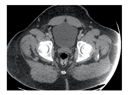
FIGURE 3: CT angiogram abdominal aorta with right lower extremity runoff shows a nonoccuslive longitudinal filling defect in the distal right external iliac artery and tibioperoneal trunk suggestive of a thrombus. There, however, are Patent common femoral artery, profunda, and SFA. Left lower extremity runoff showed a patent common femoral artery, profunda, popliteal artery and SFA. The abdominal aorta is widely patent and measures 2.3 cm the celiac, 2 cm at the SMA, and 1.7 cm below the renal arteries.

involving the thumb and the index finger. He was continued on a heparin infusion and started on an epoprostenol infusion. TEE was unremarkable and CBC and renal and hepatic function remained normal.