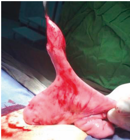
FIGURE 3: An intraoperative picture showing a Meckel's diverticulum that caused bleeding per rectum and the histopathology showed the presence of an ectopic gastric mucosa.

mucosa within the diverticulum. Some authors document that resection of the segment of the bowel that contains the diverticulum followed by primary anastomosis is preferable to wedge resection or tangential mechanical stapling due to the risk of leaving behind an abnormal heterotopic mucosa. [4, 5, 8, 9].