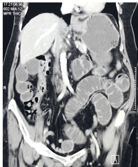
FIGURE 1: CT scan of the abdomen showing intestinal obstruction caused by Meckel's diverticulum.