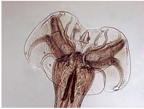
Fig. 1 C. oncophora , bursa and spicules of adult male

target genes that overcome drug action (Wolstenholme et al. 2004).