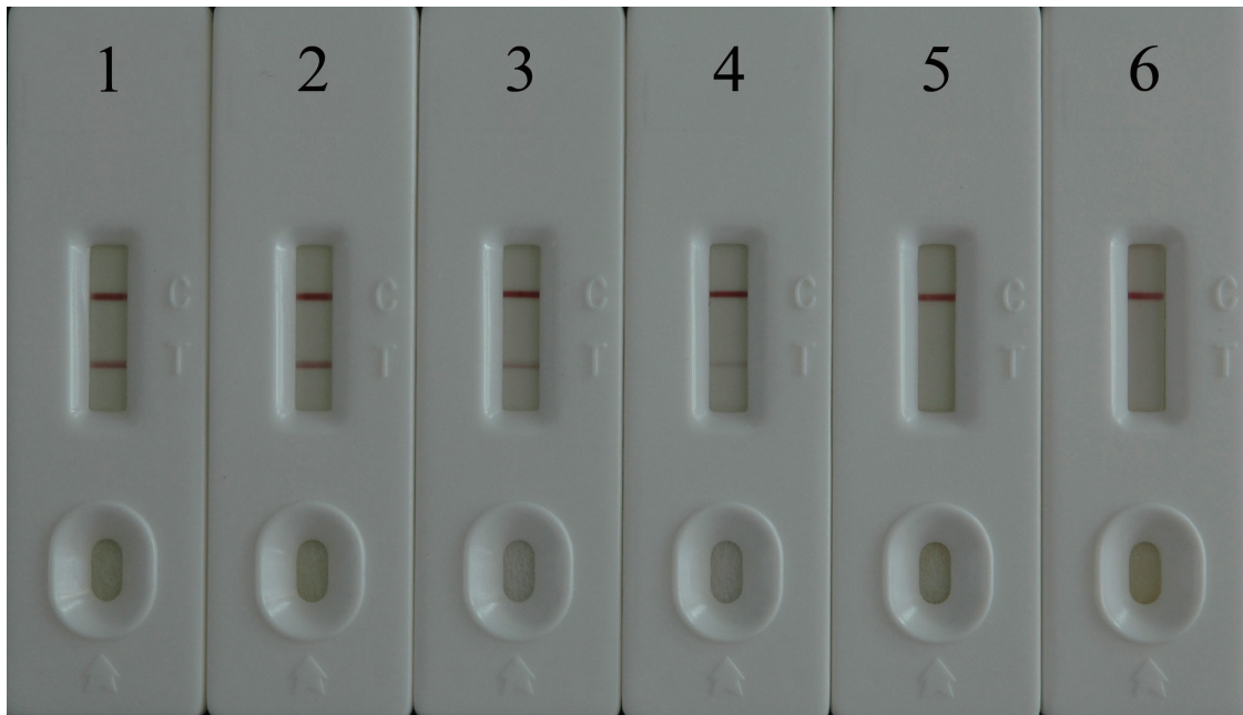
Fig. 1S. Immunochromatographic detection of A. cantonensis . 1-5, 8 ng/ml, 4 ng/ml, 2 ng/ml, 1 ng/ml, and 0.5 ng/ml of A. cantonensis ES products; 6, serum of a healthy adult.