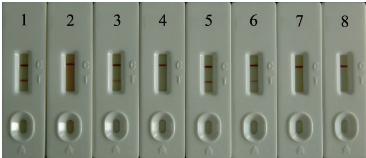
Fig. 2. Reactivity of LFIA to rat, mice, and human sera. 1-2, Sera of SD rat infected with A. cantonensis and normal rat; 3-4, Sera of SPF BALB/c mouse infected with A. cantonensis and normal one; 5-6, Sera of 2 patients infected with A. cantonensis ; 7, Serum of a healthy adult; 8, Serum of a patient infected with A. lumbricoides .

worms were 2-fold diluted to 0.5-8 ng/ml with a pooled serum of health adults. The different concentrations of A. cantonensis ES products were detected using the immunoassay strips described above. All data were processed and analyzed with Microsoft Office Excel 2007. The sensitivity, specificity, positive predictive value (PPV), and negative predictive value (NPV) were calculated relative to the 'gold' standard parasitological or serological results that correlated to each serum sample (Table S1). The 95% confidence intervals (95% CI) were determined as described previously [30]. Youden index summarizes the discriminatory accuracy of a diagnostic test and provides a ready-to-use optimal cut-point for the purpose of future diagnosis. Youden index was defined [34] as J(t) = \text{sensitivity} + \text{specificity} - 1 . Practically, this definition renders a maximum value of 1 when a diagnostic test provides a perfect separation between 2 populations and a minimum of zero when it classifies no better than chance. It was used to assess the ability of the test to discriminate true positives and true negatives.