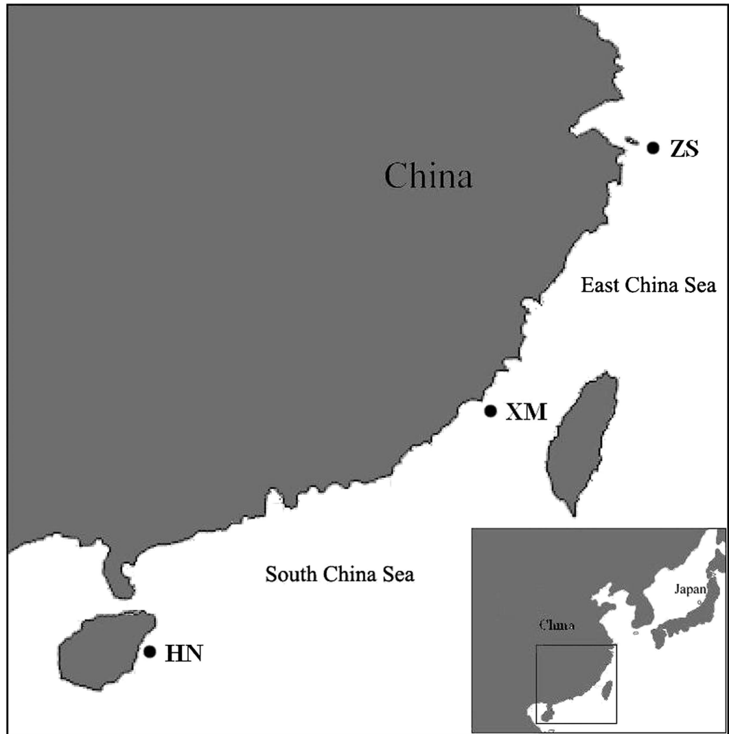
Figure 1. Three localities of Charybdis feriata collected in this study. HN, Hainan locality; XM, Xiamen locality; ZS, Zhoushan locality. This map was created by the software Adobe Photoshop 7.0.

(NC_006992), Geothelphusa dehaani (NC_007379), Fenneropenaeus chinensis (DQ518969), Litopenaeus vannamei (DQ534543), Pagurus longicarpus (NC_003058), Macrobrachium rosenbergii (NC_006880), Marsupenaeus japonicus (NC_007010), Penaeus monodon (NC_002184), Portunus trituberculatus (AB093006), Panulirus japonicus (NC_004251), Pseudocarcinus gigas (NC_006891), Scylla serrata (NC_012565), Scylla tranquebarica (NC_012567), Scylla olivacea (NC_012569), and Scylla paramamosain (JX457150). Furthermore, one species, Harpisquilla harpax (NC_006916), was used as an outgroup taxon.