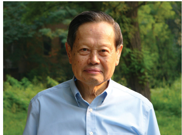
Theoretical physicist, Professor Chen-Ning Yang.

The concept of symmetry exists, for example, already in early Chinese culture, through couplets (对联), which is one simple but important manifestation of symmetry in Chinese literature.