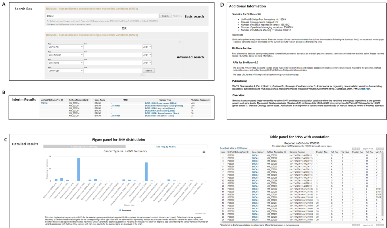
Figure 2. Interface of BioMuta. Two types of search engines are included in the interface of BioMuta (basic search for any gene name or accession, and advanced search for combined search of up to four search terms). After clicking 'search,' an interactive interim results page populates showing all possible genes matching the search criteria. After users select and click on the UniProtKB ID of their preferred gene, the detailed results page loads, displaying a figure and a table with information about all related SNVs and cancer types for this gene. APIs are integrated and users can obtain search results in JSON format by providing specific URLs. In addition to the search function, whole BioMuta datasets are downloadable, available from the tool home and archive pages.

BioMuta v3.0. The BioMuta basic search is a gene-centric search, requiring only the input of a single gene preferably in the format of HGNC approved gene symbol, UniProtKB accession, or RefSeq Gene ID. After submission of search term, an interim results page will load displaying all database hits to the specified query. From this page, the user can click the hyperlinked UniProtKB accession to navigate to the detailed results page for that particular accession record. Results pages have two primary components: charts and hit table. The default chart for BioMuta search displays the frequency of nsSNVs for the queried gene for each cancer type in which it is observed to be mutated. Hover-text displays additional information including the full cancer name, corresponding DOID, and variant count for the queried gene in that cancer. The second chart displays the frequency of nsSNVs for the queried gene along the length of the encoded protein. The hit table contains a variety of identifiers and annotations as described in the methods section above, and hyperlinks to relevant BioXpress entries and other external resources as appropriate.