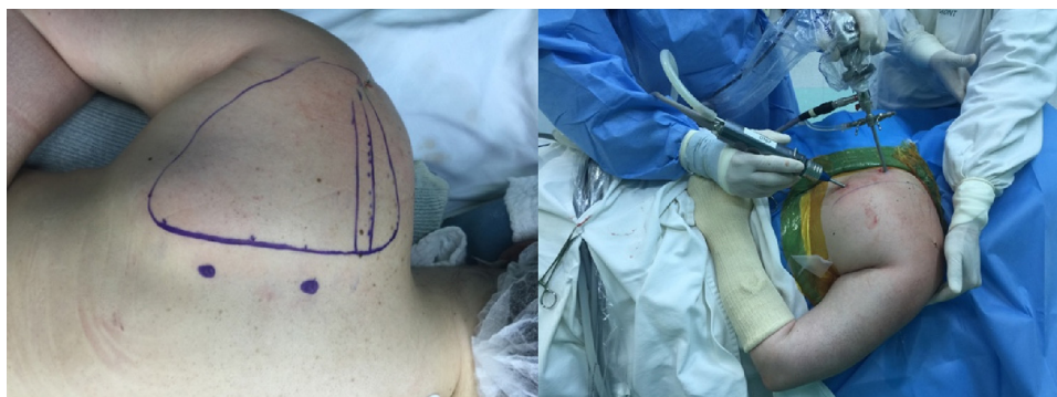
Fig. 1 – Patient in the chicken wing position.

This position elevates the medial scapular border and opens the scapulothoracic spaces for endoscopic exploration.