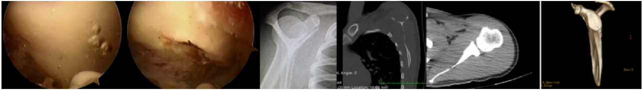
Fig. 4 – Intraoperative, radiographic, and tomography images, post bone tumor resection.