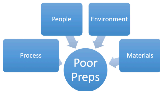
Figure 1 Factors contributing to poor colonoscopy preparations at an inpatient institution.

can be completed or not. The plan-do-study-act (PDSA) approach has been used at other facilities with success for outpatient colonoscopy preparations. 2 Our project sought to intervene on colonoscopy preparations in the inpatient setting, as this environment can provide more complexity in terms of the factors that lead to a poor preparation.