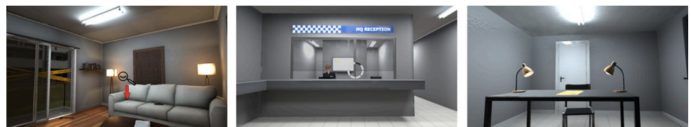
Fig 3. Rooms used in Experiment 2. Left: Crime Scene; middle: Foyer; right: Interrogation Room.

Participants were tested individually in the lab. They first received general task instructions (including cautions about use of VR equipment) and a cover story, before putting on the VR set. Participants remained standing for the entirety of the task with their back to a wall. The experimenter adjusted the VR headset and the inter-display distance until the participant reported that the environment was in focus (not blurry) and comfortable. Participants first completed a familiarisation phase in the living room, where they practiced looking around and using the controller in the VR environment and responding to prompts.