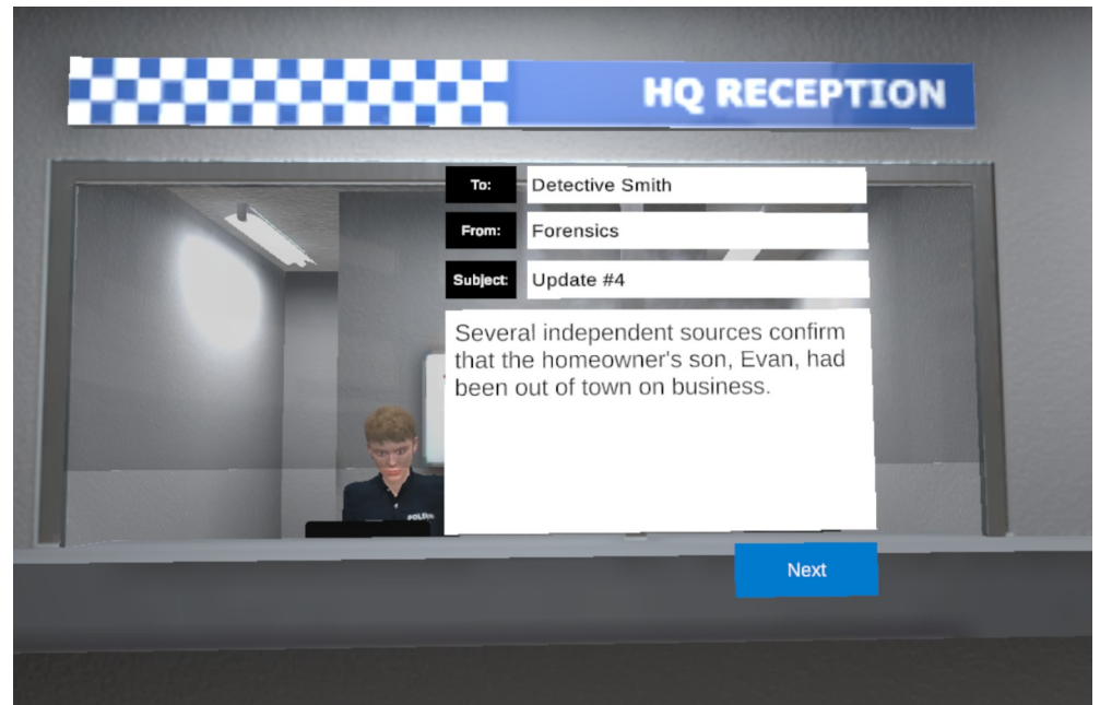
Fig 4. Example of Experiment 2's retraction email in the shift condition.

https://doi.org/10.1371/journal.pone.0271566.g004