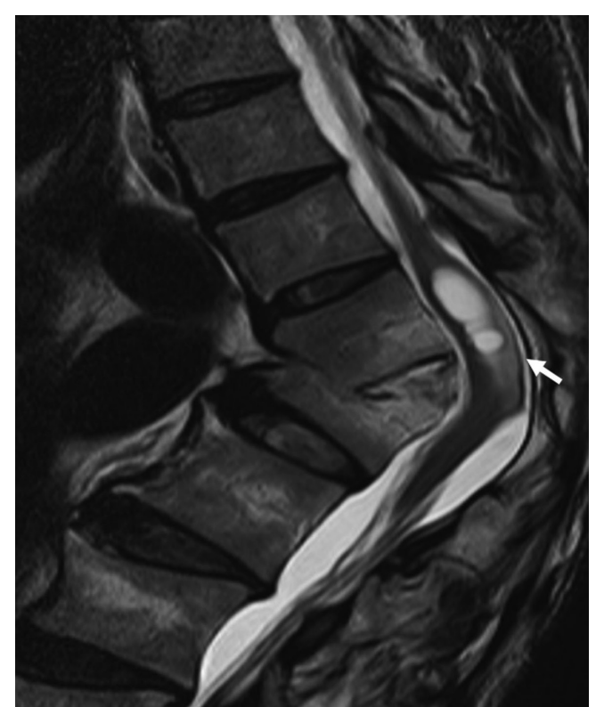
Fig. 2. 50-year old man with left sciatic pain, who had kyphotic deformity. T2-weighted sagittal image shows cystic lesion of conus medullaris and accompanying cord edema (arrow) with thoracic kyphosis.

greater the severity of the clinical symptoms.