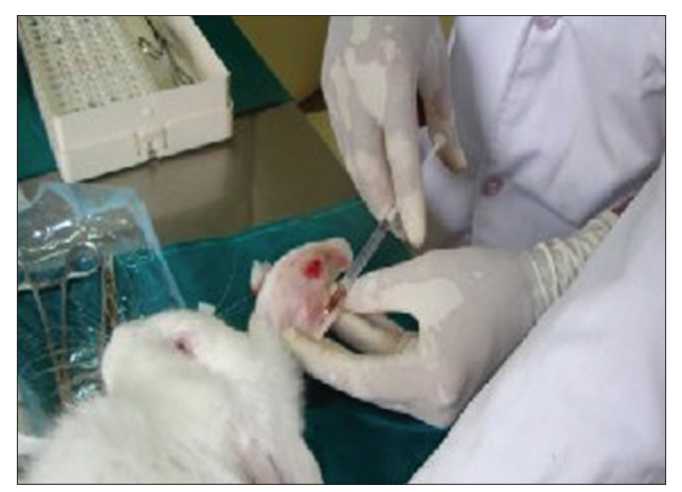
Figure 2: Administration of Ketamine through lateral auricular vein