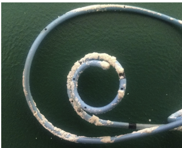
Figure 1 Encrustations on stent surface after 2 weeks indwelling time in chronically infected urinary tract system.

Every stent that has been placed, will eventually need to be removed or replaced. Despite best efforts however,