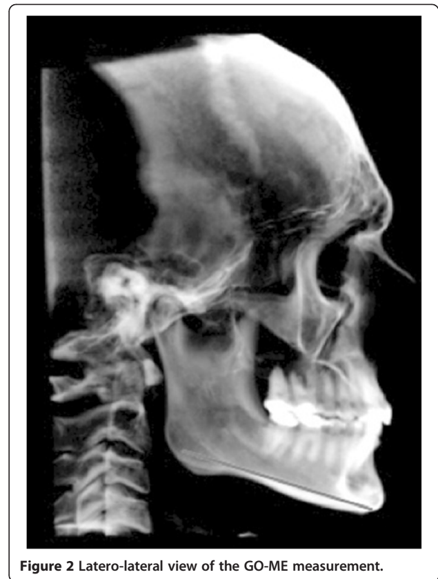
Figure 2 Latero-lateral view of the GO-ME measurement.

The 3D versus 3D comparison assessed by Student's t test where p < 0.05 was not proved to be statistically significant. The 2D versus 2D comparison was not proved to be statistically significant.