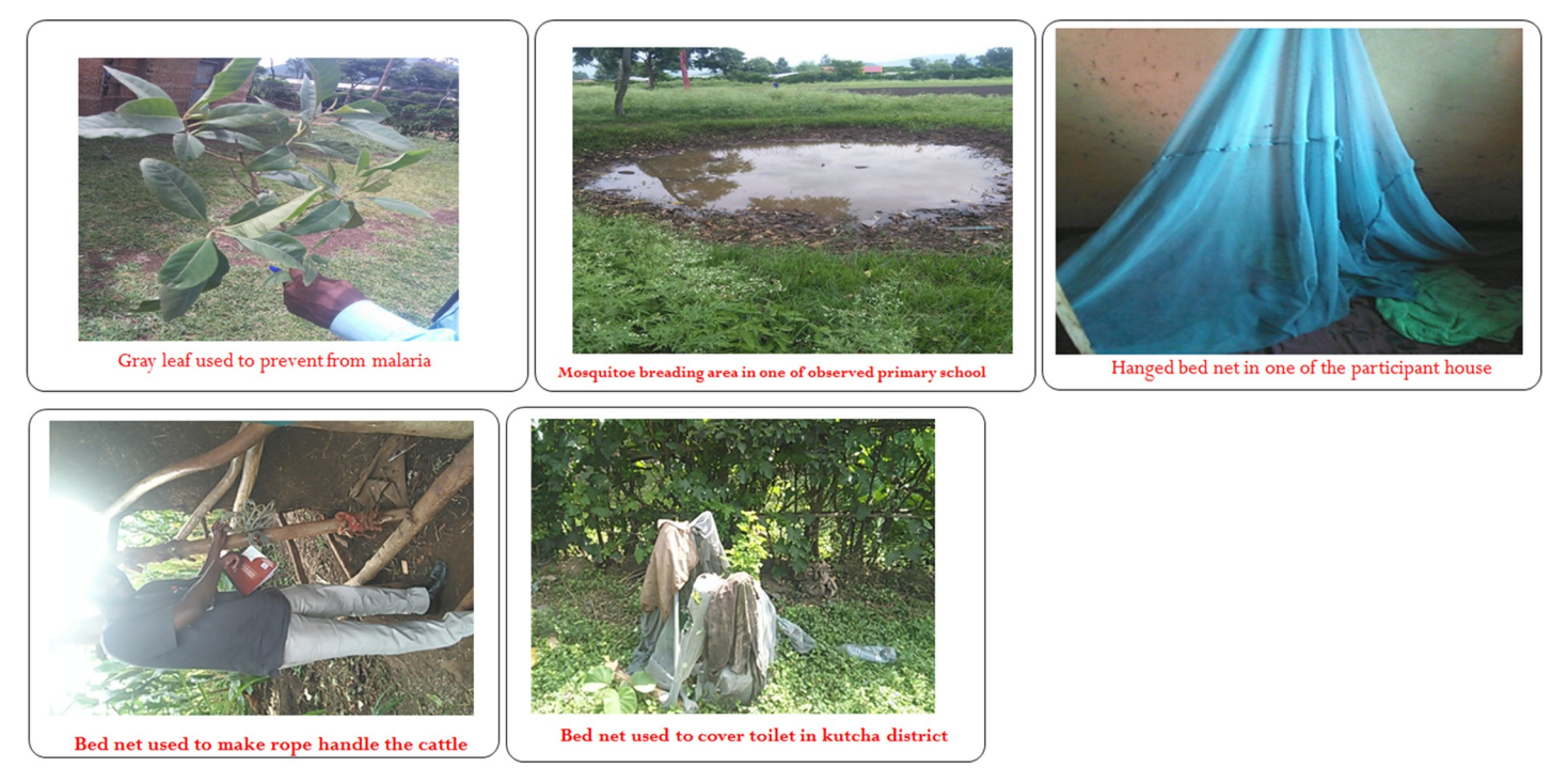
Fig 2. Pictures of gray leaf, mosquitoe breading site, hanged bed net, misuse of bed net as rope and toilet cover from left to right in this fig.