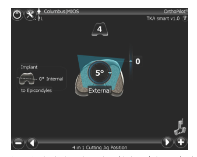
Figure 1. The implant size and positioning of the rotational position of femoral cutting jig.

variable and knowledge of this using navigation provides a better understanding of this orientation in individual patients [36], which offers an advantage for precise positioning of the acetabular component. Several studies have demonstrated convincingly that the acetabular orientation is more precise with navigated THA [37, 38], acetabular component was beyond the Lewinnek's safe zone only in 8.63% of hips in the navigated group, compared with 28.4% in the conventional group [39].