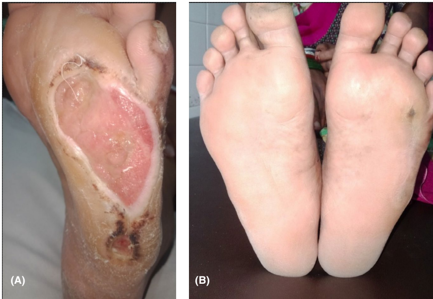
FIGURE 1 A, Single well-defined 5 \times 3 \text{ cm}^2 ulcer over planter aspect of left foot with sloping edge, hyperkeratotic margin, and floor with healthy granulation tissue. B, Healed ulcer after 4 wk