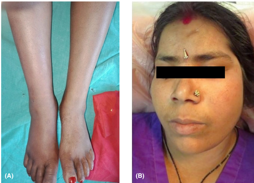
FIGURE 2 A, Edema over bilateral legs and feet. B, Erythematous edematous area on left cheek

Three months later, the patient developed acute onset swelling of bilateral legs associated with tingling sensation disturbing daily activities. There was presence of pitting edema over bilateral feet extending till distal one-third of legs (Figure 2A). Similarly, erythematous edematous area was noticed over left cheek (Figure 2B).