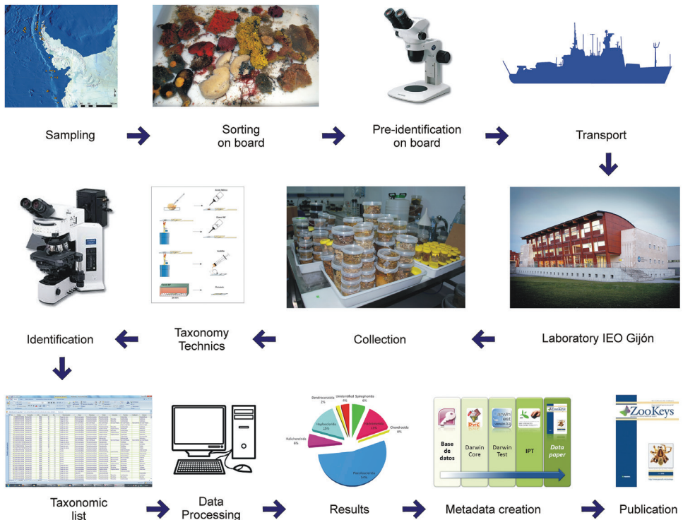
Figure 2. Summary of the procedure used to generate the dataset.

The objective was to collect lithological samples and associated benthic fauna exposed to hydrothermalism.