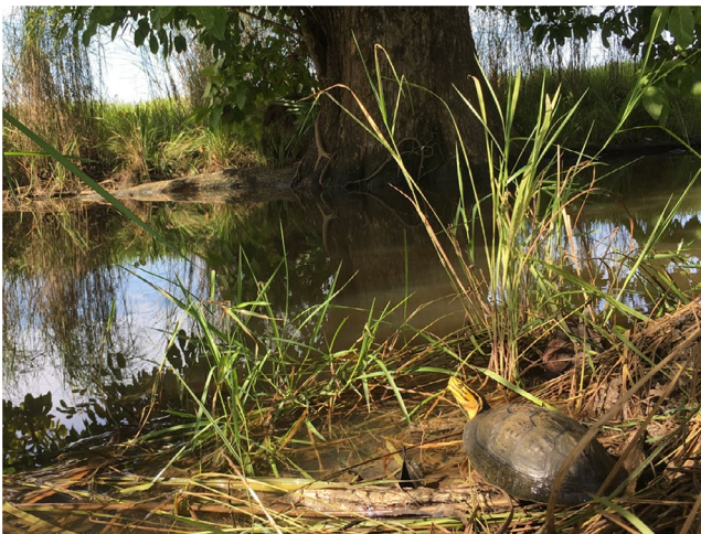
FIGURE 1 Adult Southeast Asian box turtle ( Cuora amboinensis ) near an ephemeral wetland in savanna, Rawa Aopa Watumohai National Park, South East Sulawesi, Indonesia.

In addition to their roles as predators and scavengers in aquatic and terrestrial habitats and moving nutrients between ecosystems, C. amboinensis are likely prey for birds and mammals in our study area. Although we did not document instances of predation, C. amboinensis , and particularly eggs and hatchlings, have been documented as prey of crocodiles, monitor lizards, wetland birds, and mid-sized mammals, such as civets (Moll & Moll, 2004; Stanner, 2010). Given that this turtle has a hinged plastron, or lower shell, and can