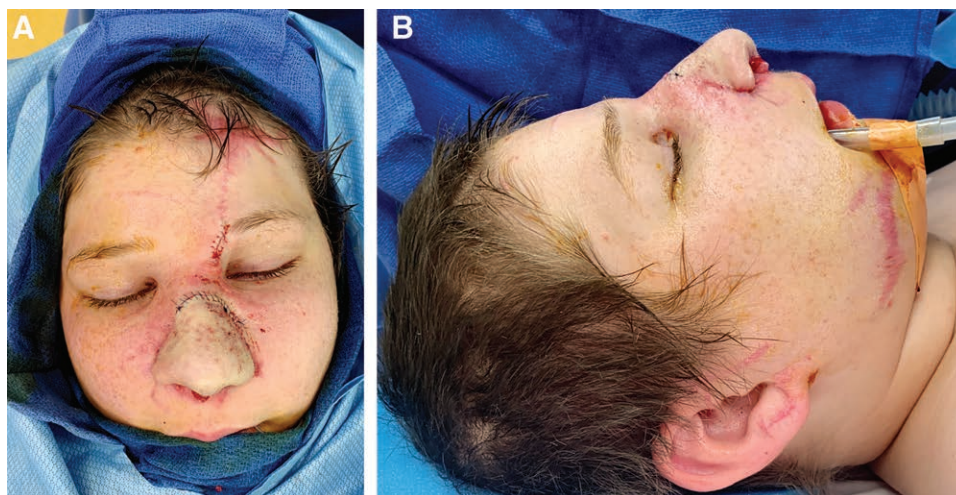
Fig. 3. Postoperative demonstration after the course of reconstructive procedures. (A) Frontal view. (B) Right lateral view.