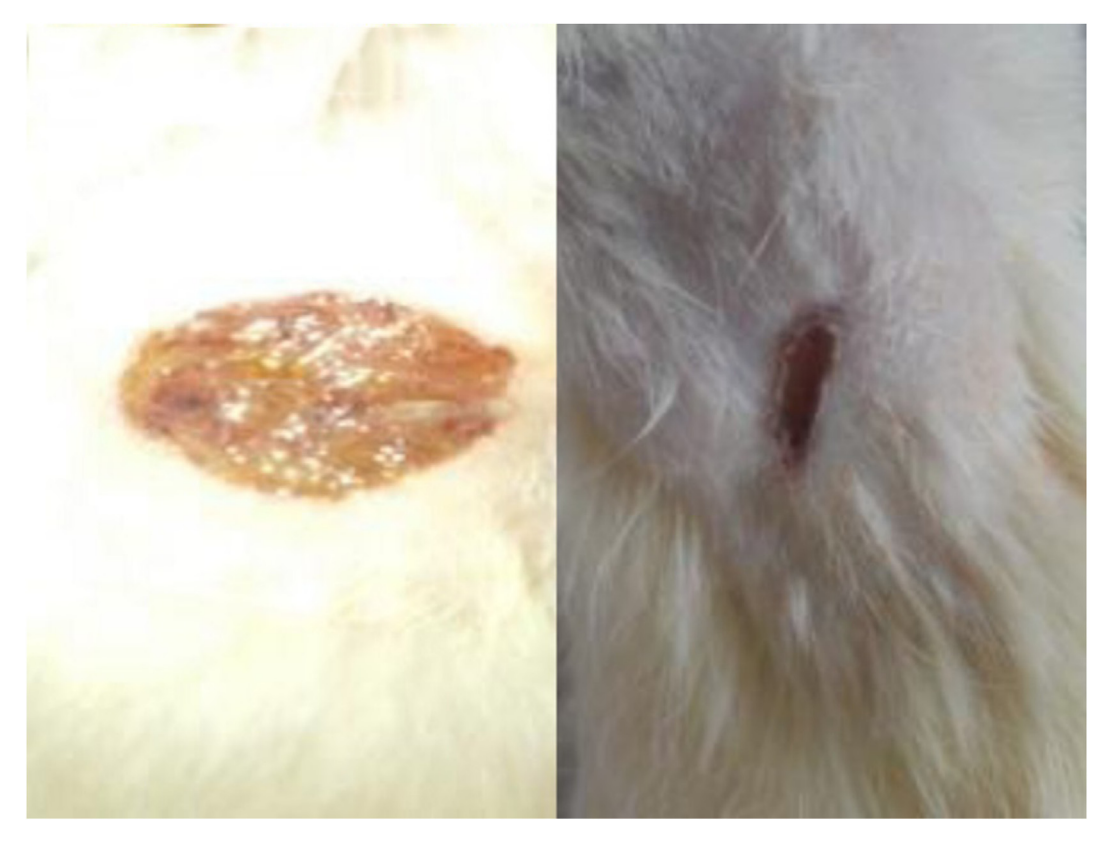
Fig. 1. Wound of Control group 4<sup>th</sup> day (19/3/2015) and 16<sup>th</sup> day (31/3/2015).