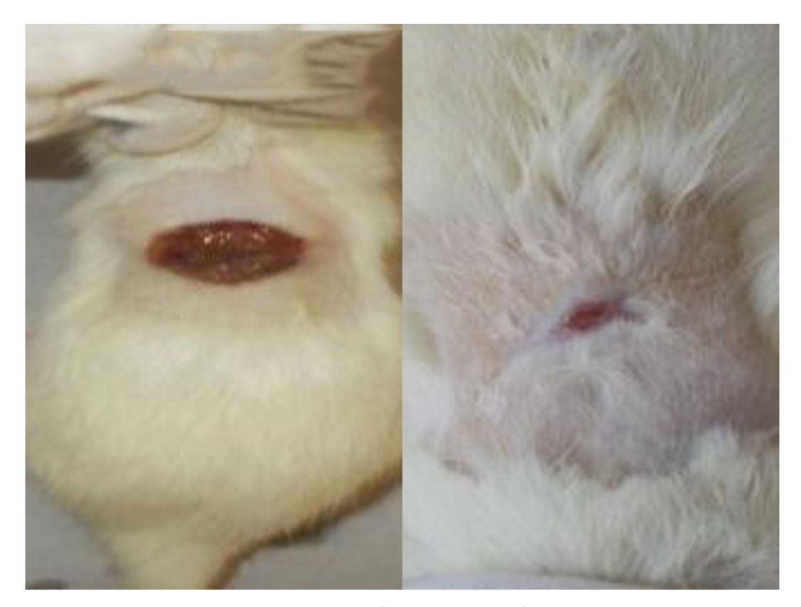
Fig. 2. Wound of Standard group 4^{th} day (19/3/2015) and 16^{th} day (31/3/2015).