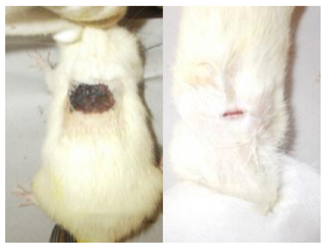
Fig. 3. Wound of Test group 4^{th} day (19/3/2015) and 16^{th} day (31/3/2015).

promotes angiogenic responses in wounds in both in vitro in vivo models [24]. Several copper-dependent enzymes, mainly amine oxidases, are known to be increased during wound healing. These copper-dependent enzymes are important in the remodeling and healing of the wounds [25]. Sphatika (Potash Alum) possess astringent and hemostatic properties and helps in the tissue contraction and reduces inflammation there by enhances wound healing [26]. Shodhitakasisa is known to possess krimighna (Antimicrobial) and vranaghna (wound healing) properties [27]. Recent researches showed similar wound contraction rate of polyherbal fractions of Clinacanthus nutans and Elephanto pusscaber when compared to PK [28]. A study conducted on polyherbal formulation showed similar results on excision wound healing model [17,29,30]. This emphasizes that, the test drug has started showing the wound healing effect from the initial day of the wound.