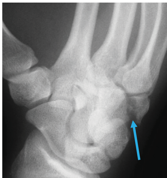
Figure 2 Pronated oblique 30° x-ray view. Blue arrow shows fracture site.

It is commonly recognised that hyperextension injuries to the hand are associated with carpal bone fractures, especially scaphoid. This case and others[2] establish a link between minimal palmar flexed injuries and hamate fractures.