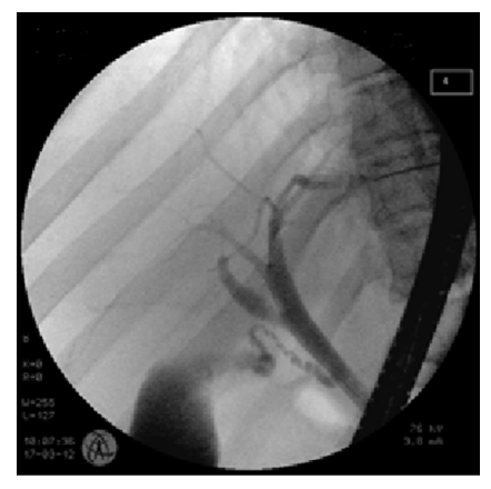
Fig.5: Huang type A4

sification. The prevalence of A1 Huang (right dominant) classification was 45% that was the most prevalent type among our patients. Type A2 Huang (trifurcation) was seen in 78 patients (21.5%). Type A3 Huang (left dominant) was seen in 48 patients (13.3%). Type A4 was seen in 13 patients (3.6%). There was no patient categorized as type 5. Non-right dominant anatomy was seen in 55% of our patients. The frequencies of anatomical variants are shown in table 1.