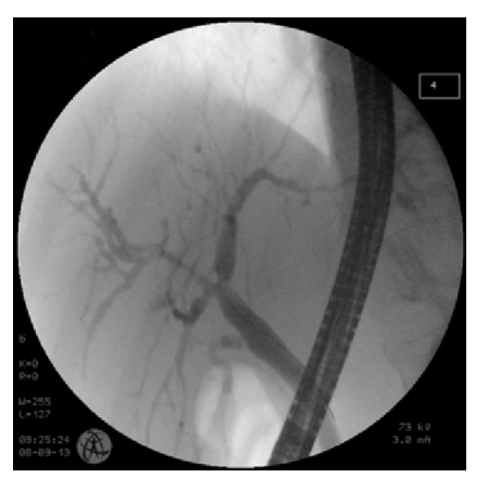
Fig.3: Huang type A2

Of the 413 patients who underwent ERCP during the study period, a total of 362 patients (181 men and 181 women) were included in the study. 51 patients were excluded due to unsatisfactory or disagreed images. 163 patients had type A1 Huang (right dominant) clas-