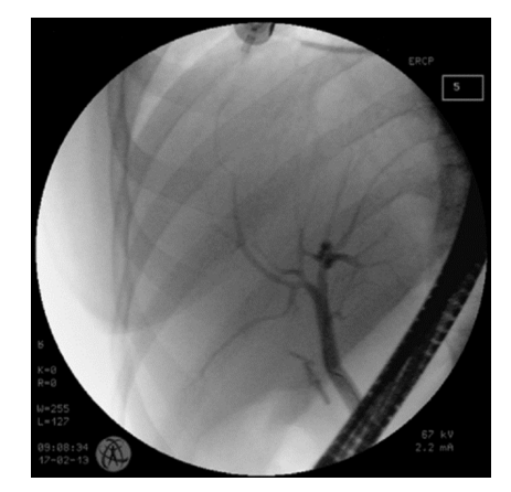
Fig.2: Huang type A1