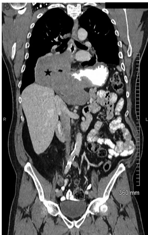
Figure 2: Coronal view of contrast-enhanced MDCT showing the exophytic, non-obstructive lesion (★) located at the esogastric junction.

pelvis with a digestive presacral fistulization without circumscribed fluid collection. A sagittal section abdominal CT and magnetic resonance imaging (MRI) (Figs. 1–2) showed colic fistula to the presacral collection measured to 38.8 × 9.54 mm with infiltration of adjacent soft tissue and which continues to the spinal canal through the sacral S1 left hole with multiple epidural abscess from L4 to S4. There was osteitis of the sacrum and arachnoiditis.