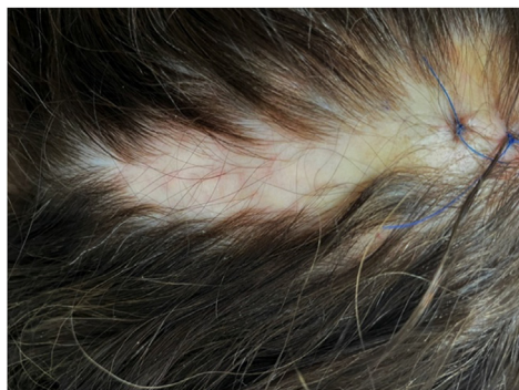
Fig 1. Irregular atrophic plaque of scarring alopecia in the mid-superior occipital scalp.