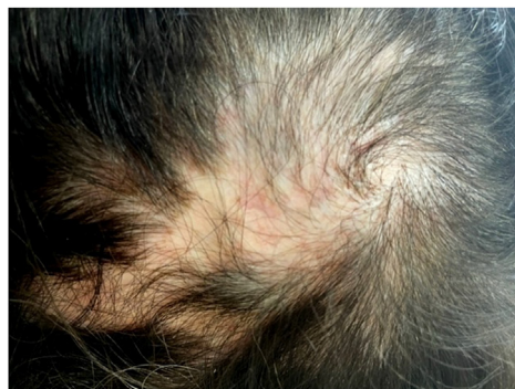
Fig 4. Gradual regrowth of fine hair, 8 months after the injection.