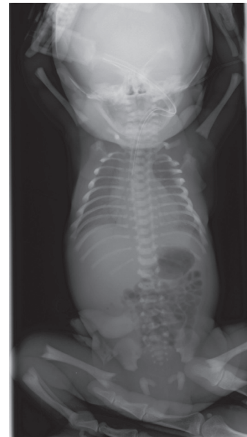
Fig. 3 Radiograph on birthday. Metaphyseal radiolucency, but no sclerotic change, was shown in the neonatal period.

vulnerable to caries, leading to extraction at 3 yr of age. By contrast, the lower deciduous teeth were all normal in size without caries. Ophthalmologic examination at 3 yr of age excluded optic nerve atrophy, and his hearing ability was normal based on clinical criteria. He watched his favorite TV programs from a few meters away at that time. He pointed at a character in a picture book. He spoke, but not in sentences. At three years of age, his developmental level was equivalent to one year according to Enjoji's analytical developmental test. Motor development was delayed. He was able to stand unaided but unable to walk at 4 yr of age. The skeletal changes at 4 yr of age were essentially the same as those at 13 mo of age, other than more conspicuous metaphyseal undermodeling and mild bowing of the long bones (data not shown).