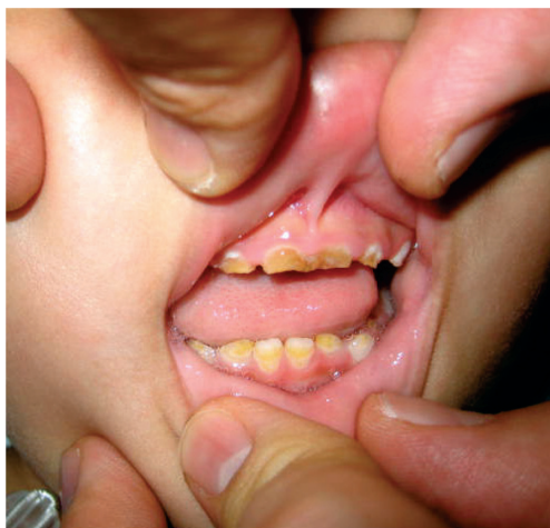
Fig. 4 Deciduous teeth at 2 yr of age. The color of the upper teeth was more yellow than that of the lower teeth, and the upper teeth were more hypoplastic than the lower teeth. Subsequently, all the upper teeth were extracted by 3 yr of age, but the lower teeth appeared to be normal.