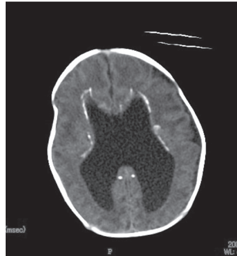
Fig. 1 Brain CT as a neonate. Symmetrical calcifications in the periventricular area and ventricular enlargement were found. Calcifications in the corpus callosum and pyramidal tract were also found in the other slices.

At 13 mo of age, he presented with generalized convulsion and unconsciousness with respiratory failure, which were promptly alleviated with intensive convulsion and respiratory care. The deciduous teeth were reported to have erupted at 6 mo of age. At 13 mo of age, his body length was 74 cm (-0.7SD), weight was 9 kg (mean) and arm span was 68 cm. On physical examination, he showed frontal bossing, saddle nose, small, yellowish upper deciduous teeth (Fig. 4) and