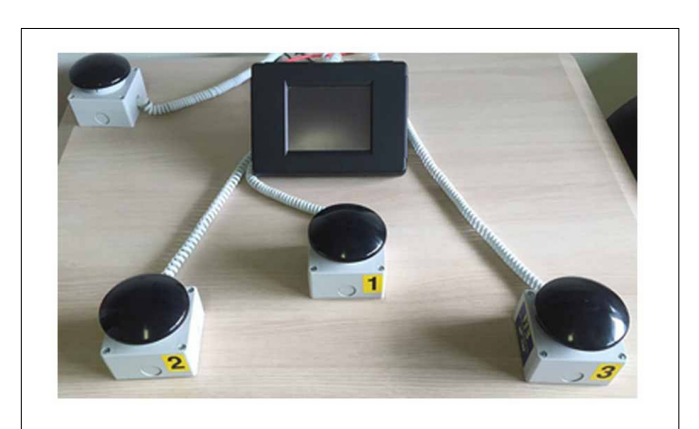
FIGURE 1 Device used to assess attention. System used to assess attention by the evaluation of the performance in a computer-controlled reaction times paradigm (ITB Sport Reflection, F.M. Automazione S.r.I., Brescia, Italia).

Subjects were asked to seat directly in front of a 5.7" diagonal monitor (display resolution 320 \times RGB \times 240 ; Pixel Pitch 0.36 H \times 0.36 V; active area 115.2 W \times 86.4 H; outline dimension 144.0 W \times 140.6 H \times 12.8 T without FPCB tail; color garmut NTSC 58%) at a distance that was comfortable to them. The investigators read the instructions before the starting of experimental tasks. For each task, subjects performed one training section in order to become confident with the experiment and avoid the bias related to the learning effect of testretest. Subjects were instructed to place their preferred hand on a table, always at the same distance from the response buttons, in a specific position indicated with a black line. Subjects had to look at the screen and press the response key (response button) when a target-stimulus appeared using their preferred hand. Between the stimuli, the subject had to remain with the hand at rest on the table.